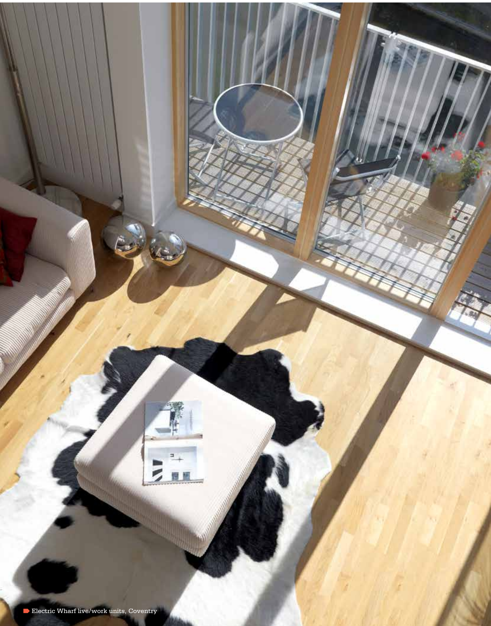
Electric Wharf live/work units, Coventry