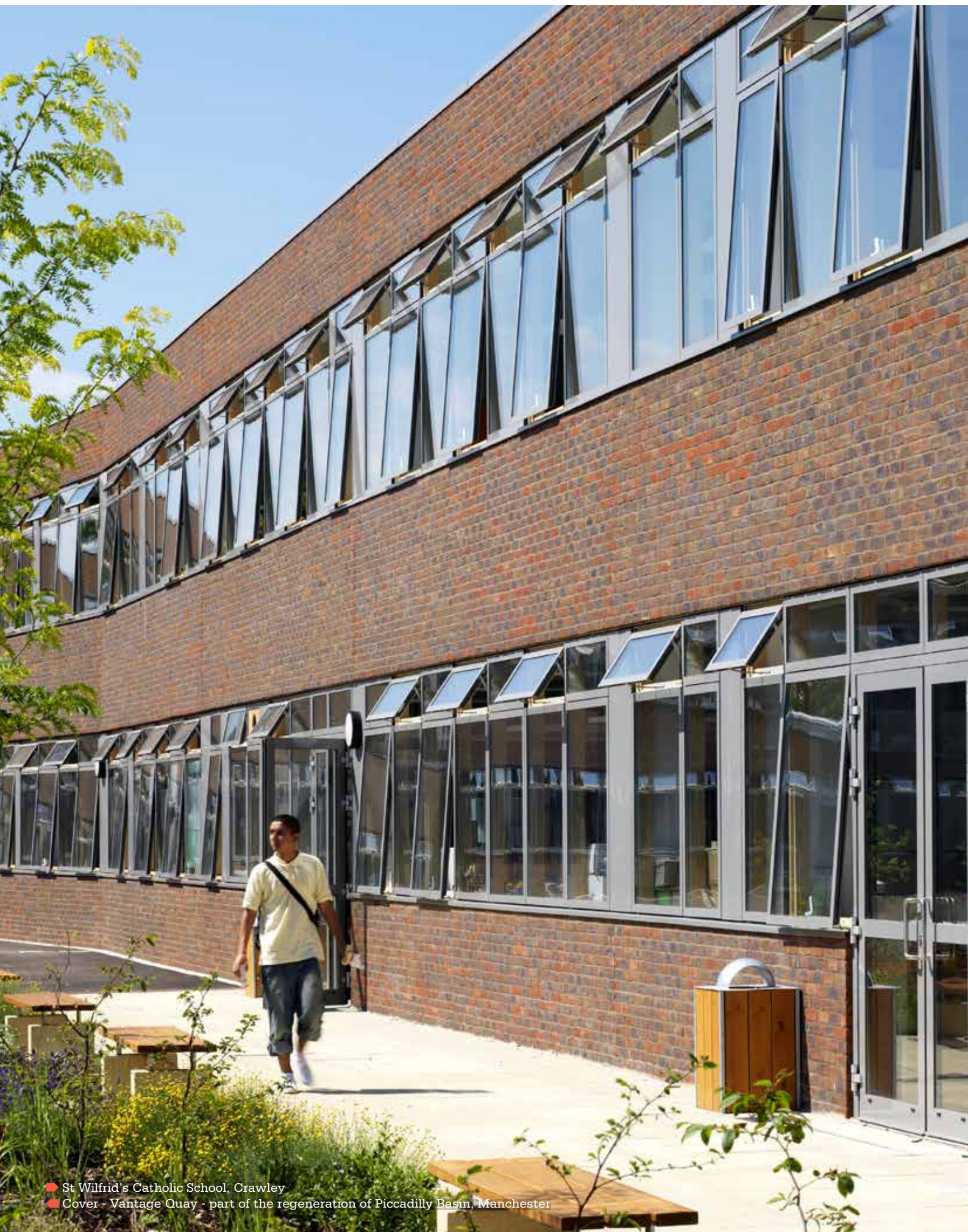
● St Wilfrid's Catholic School, Crawley ● Cover - Vantage Quay - part of the regeneration of Piccadilly Basin, Manchester