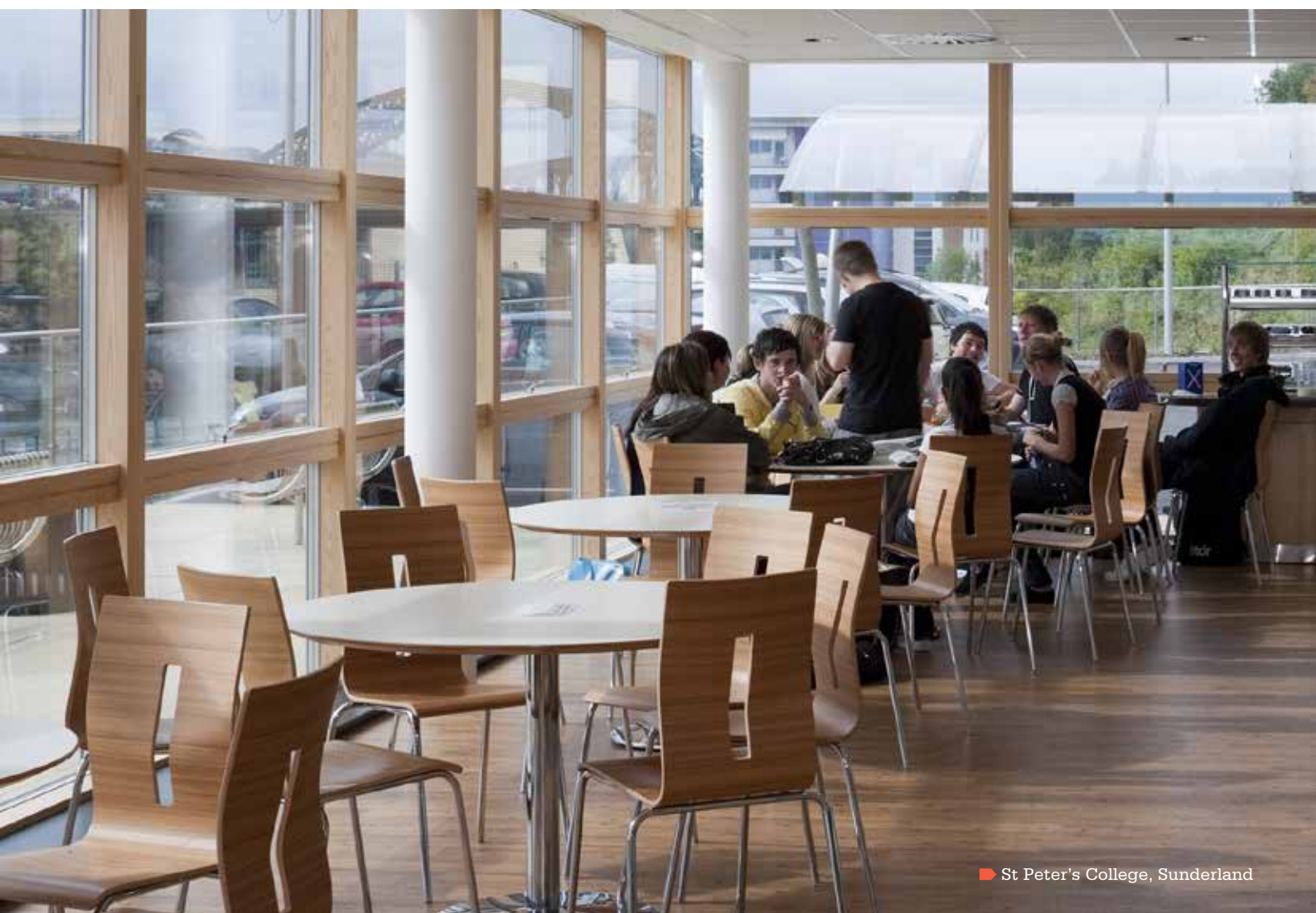
St Peter's College, Sunderland

Tried and tested. Millions of VELFAC windows are installed across Europe and thousands of people test them every day. Despite our highly successful track record, we maintain a demanding testing programme to ensure our windows continue to satisfy all necessary regulatory standards. Through this regime and as clear evidence of the confidence we have in our products, we offer a comprehensive 12 Year Warranty - this confidence is based on sure knowledge that the materials used are of the highest quality and that our window construction is proven.