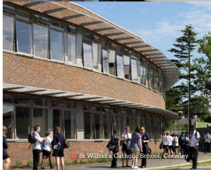
■ St Wilfrid's Catholic School, Crawley