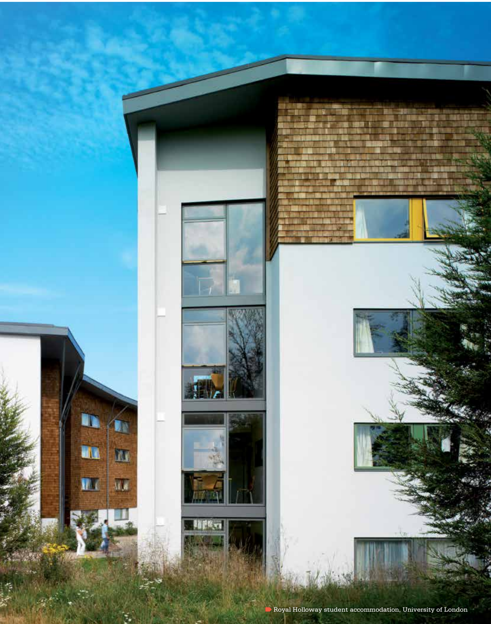
● Royal Holloway student accommodation, University of London