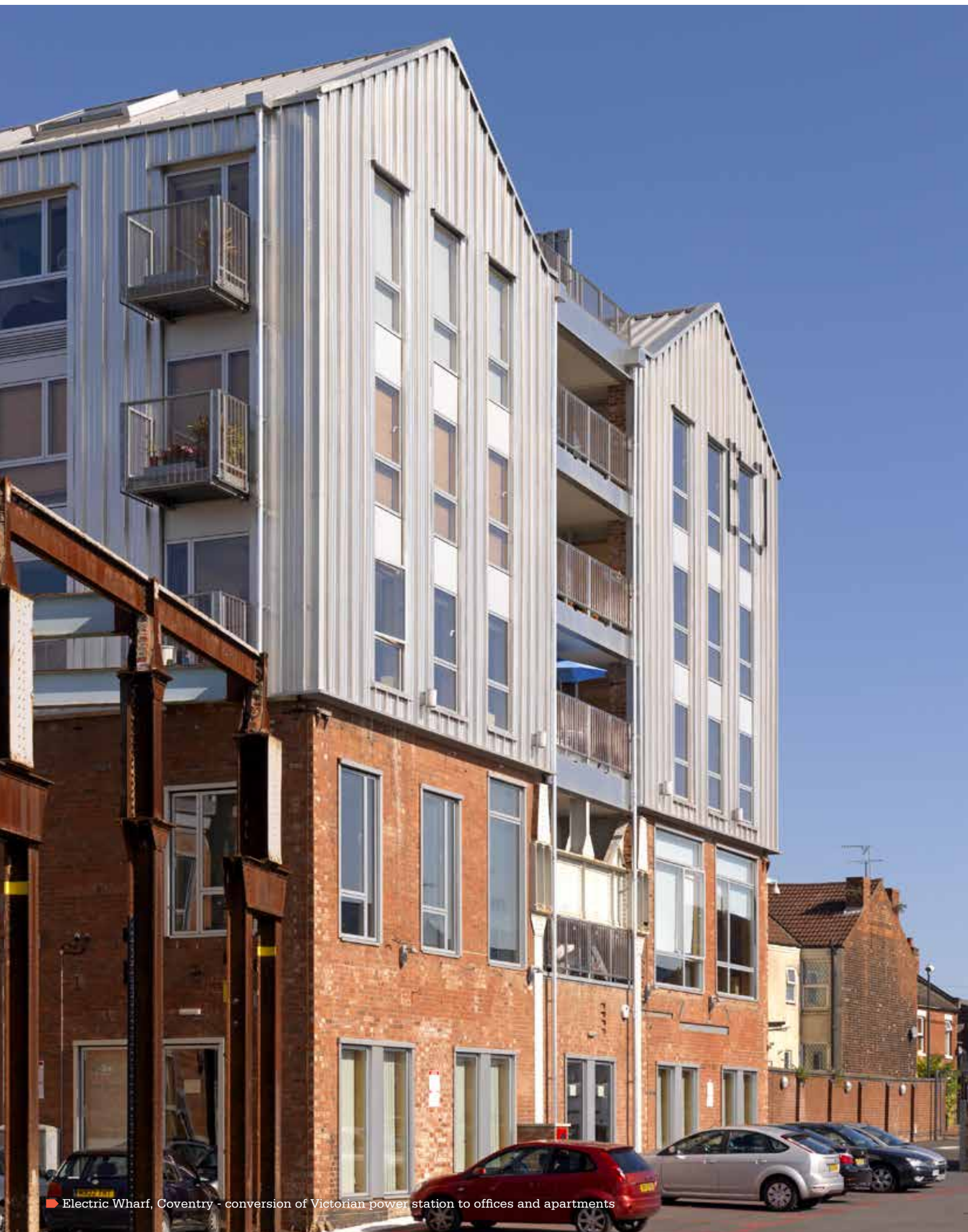
Electric Wharf, Coventry - conversion of Victorian power station to offices and apartments