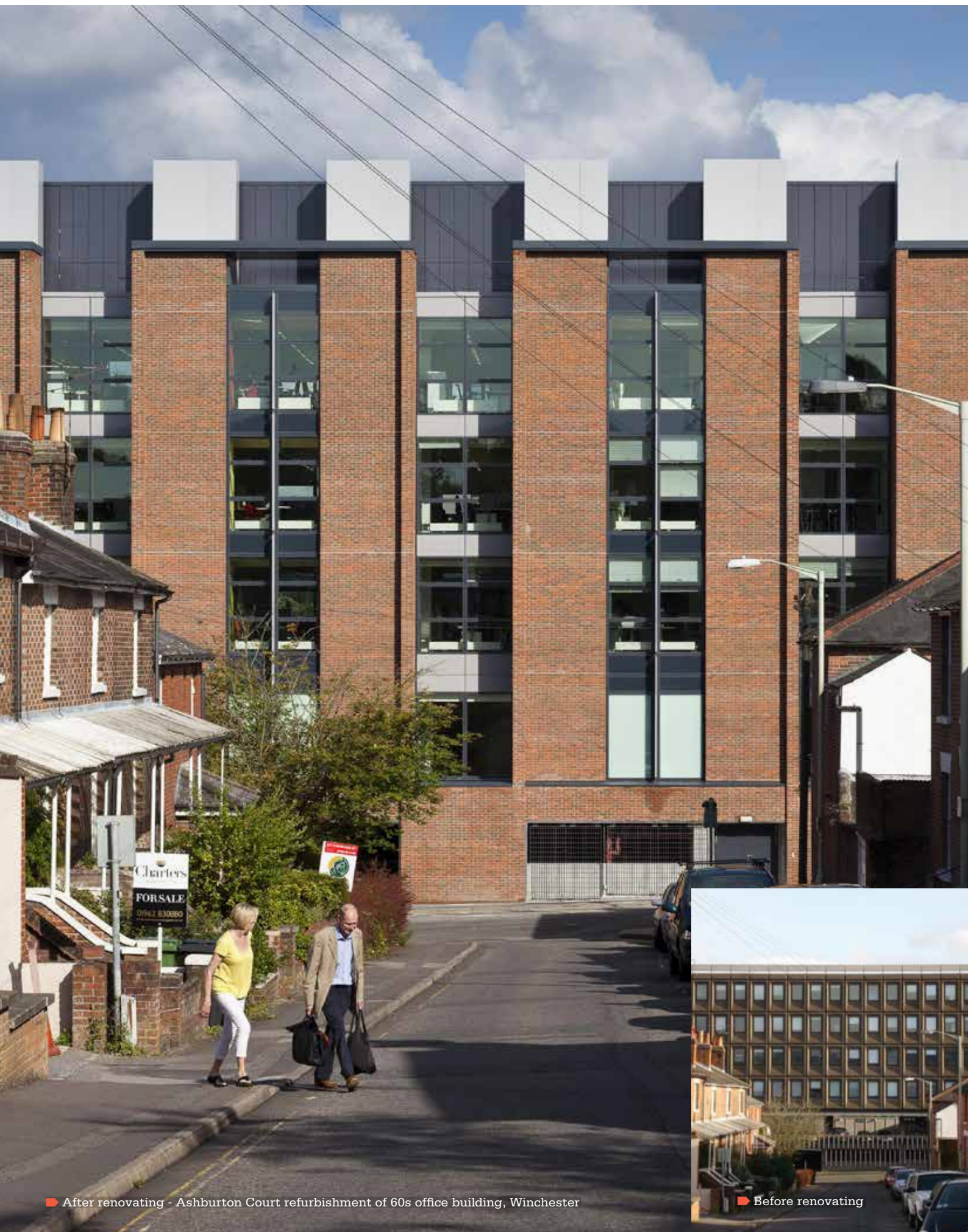
After renovating - Ashburton Court refurbishment of 60s office building, Winchester