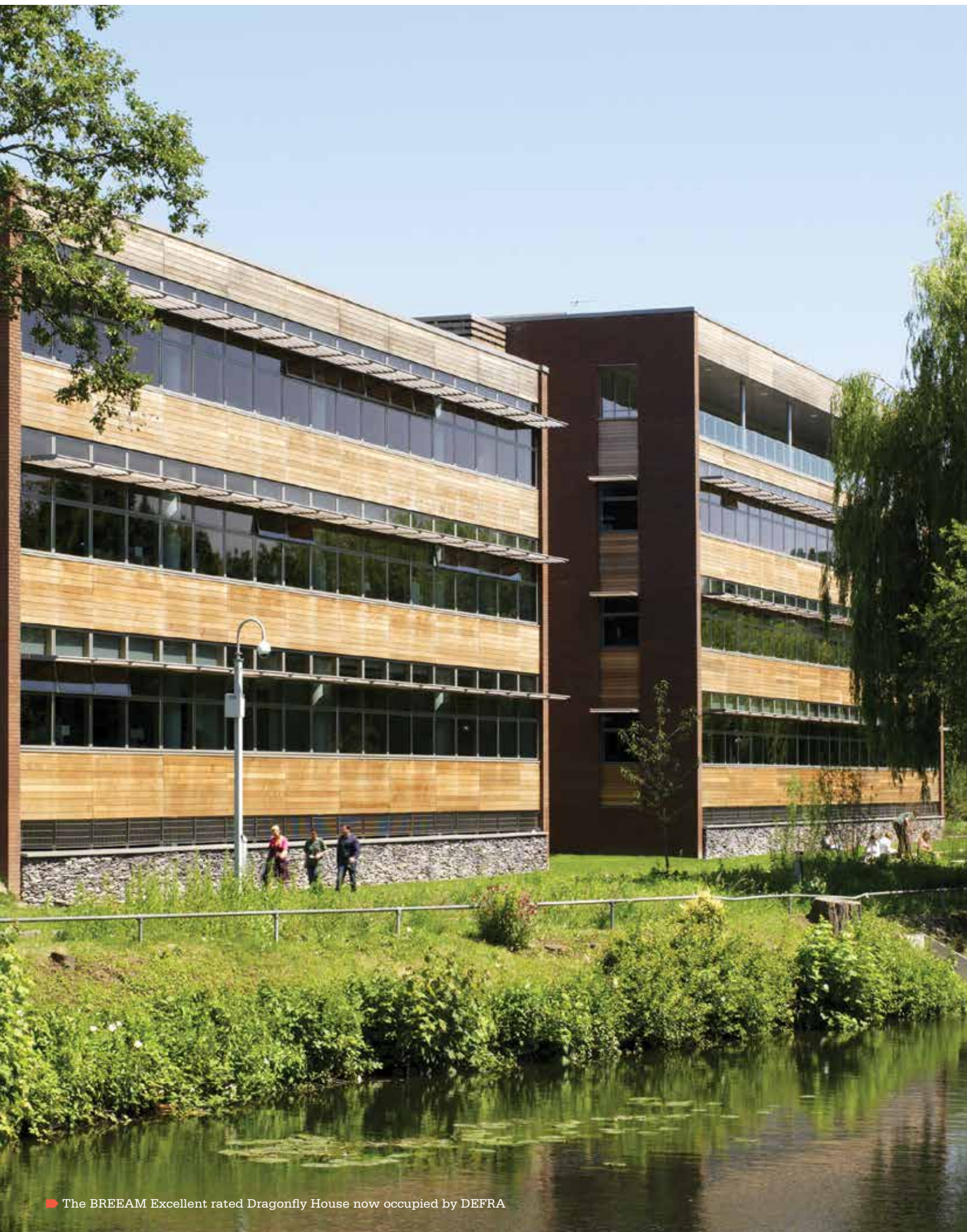
■ The BREEAM Excellent rated Dragonfly House now occupied by DEFRA