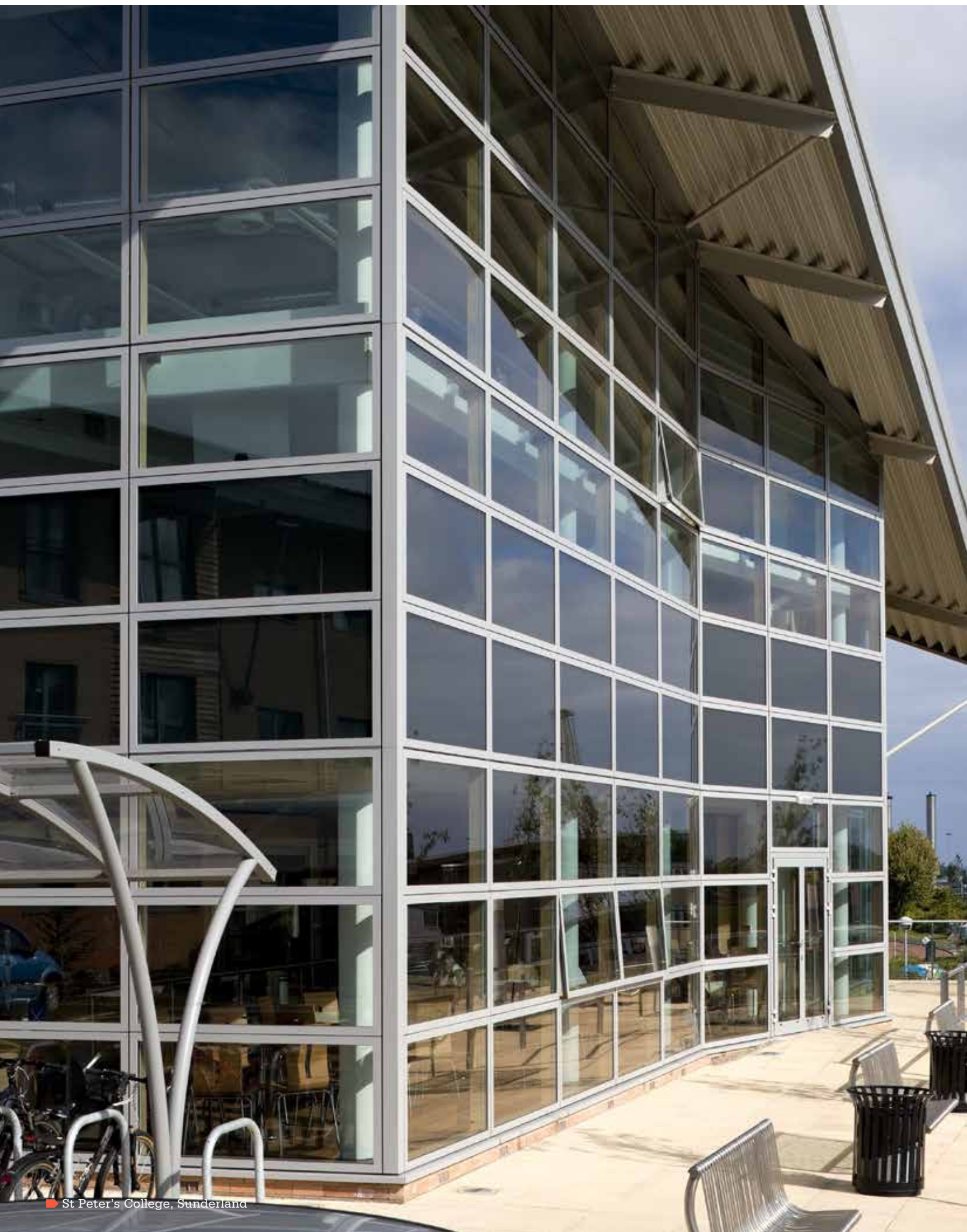
St Peter's College, Sunderland