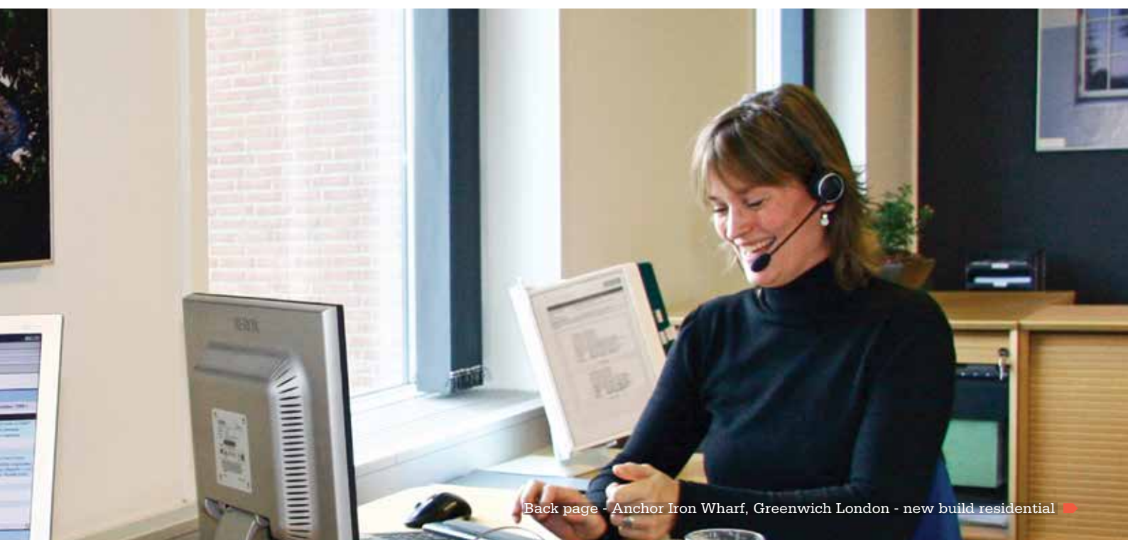
Back page - Anchor Iron Wharf, Greenwich London - new build residential