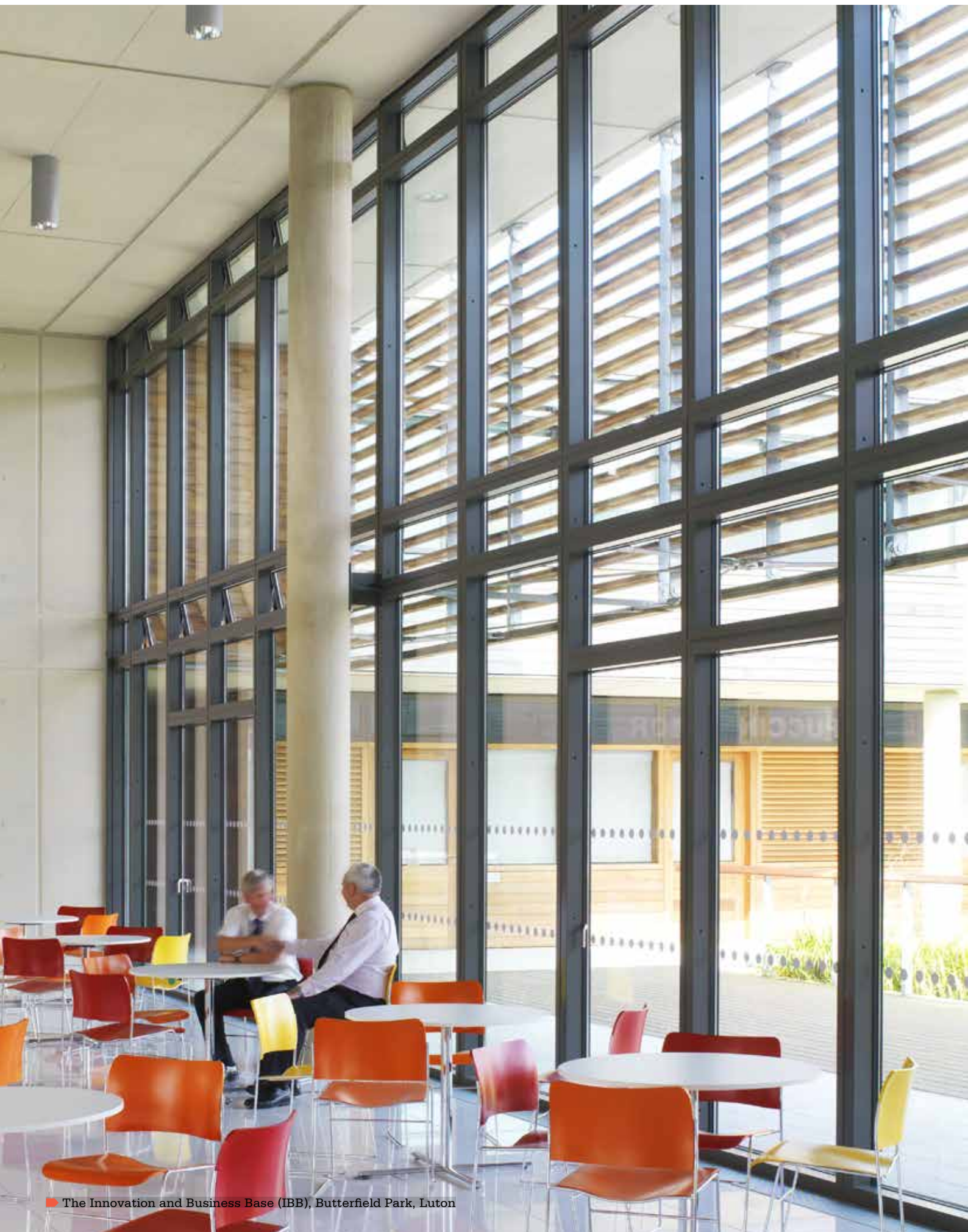
■ The Innovation and Business Base (IBB), Butterfield Park, Luton