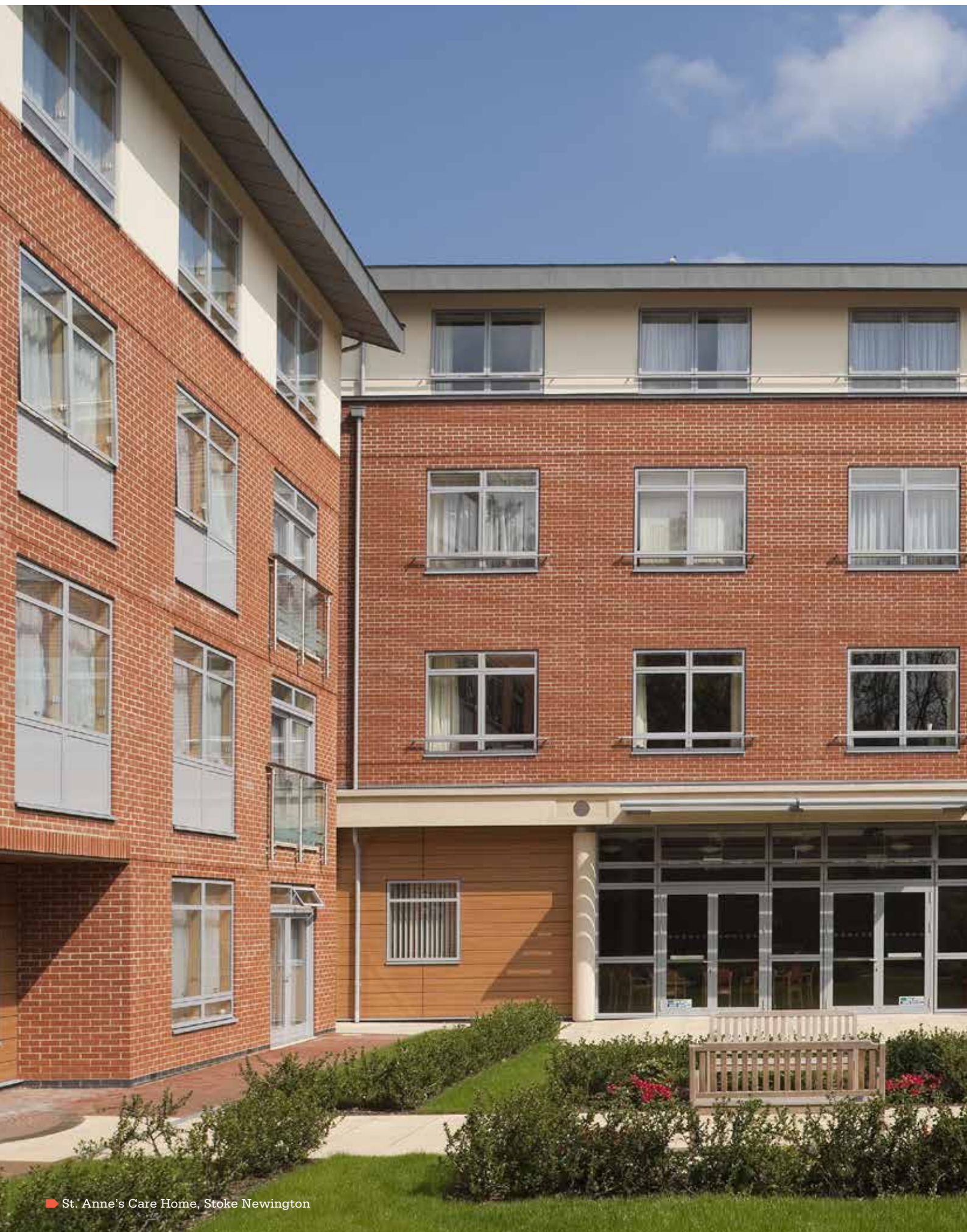
■ St. Anne's Care Home, Stoke Newington