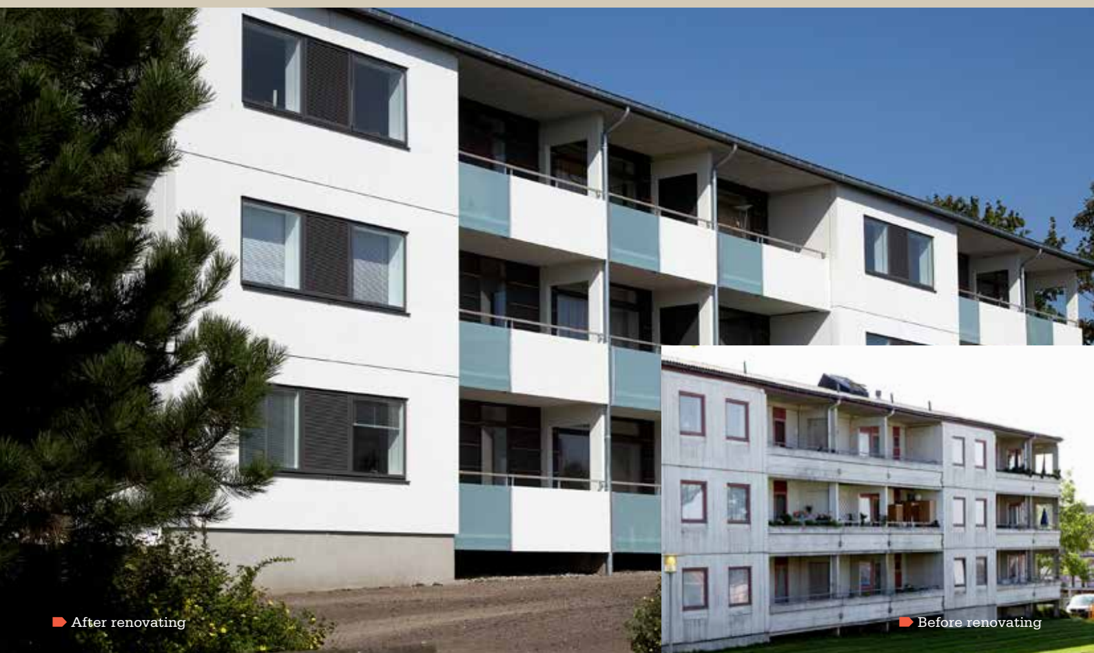
► After renovating

► For more information about refurbishment and renovating projects, please call 01223 897100.